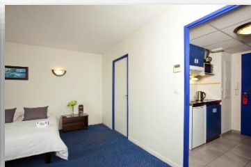
Double bed studio