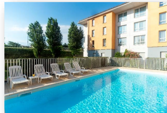
CERISE Carcassonne Nord out-wall

The residence is the ideal starting-point to discover the Cathar country and is situated from 4km to the historical centre of the town.