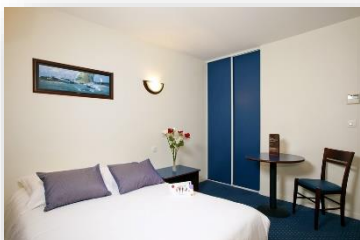
Single bed studio