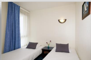
Apartment for 6 persons