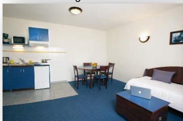
Apartment for 4 persons