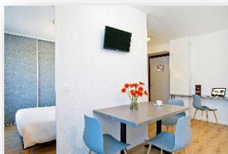
Apartment for 4 persons