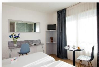
Twin beds studio