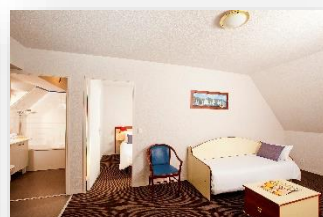
Apartment for 6 persons