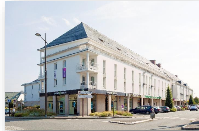
CERISE Lannion out-wall

The residence is perfect to discover the magnificent scenery of the Côte de Granite Rose !