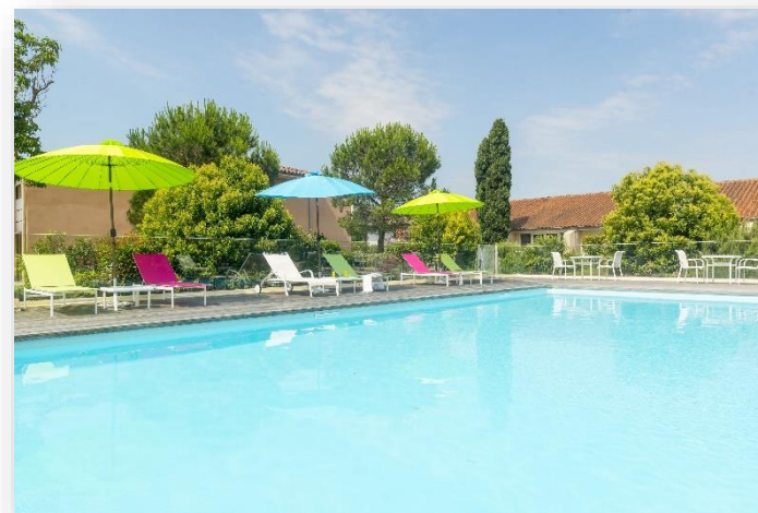
Exterior view of Residence de Diane

An exclusive hotel residence with outdoor a swimming pool and a tennis court, 15 minutes from the center of Toulouse.