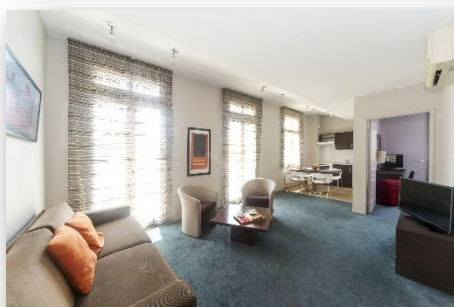
Apartment for 4 persons