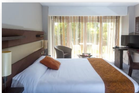
Double bed studio

Free Wifi / Bein Sports / free car park / Laundry service (€) / Ironing equipment on loan at the reception etc.