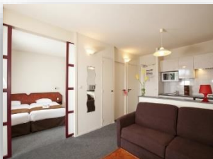
Appartement for 3 persons