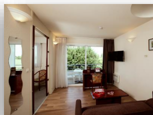
Appartement for 4 persons