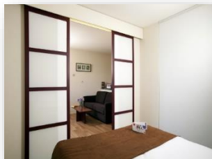
Appartement for 2 persons

Free Internet / Free parking / Private swimming-pool / Laundromat / etc.