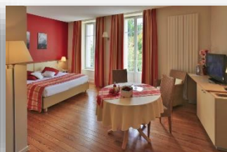
Studio for 4 persons