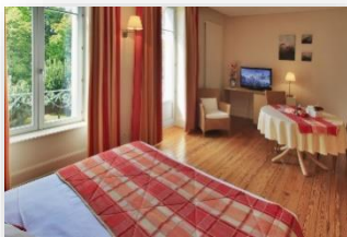
Studio for 3 persons