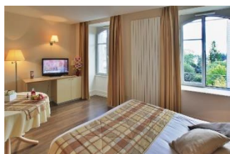
Studio for 2 persons

Elevator / WIFI / Car Park / green space / Newspapers available / Room service / Laundry service etc.