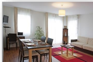
Apartment for 6 persons