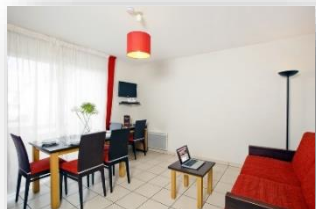
Apartment for 4 persons