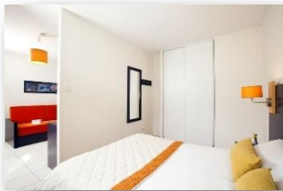
Studio for 2 persons

Free Wifi / Free parking / Laundromat / etc.