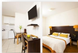
Studio for 3 persons