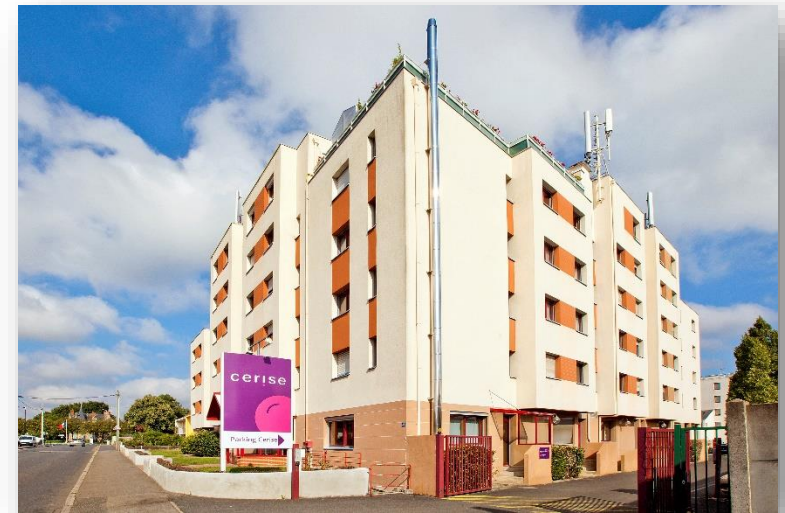
CERISE Nantes la Beaujoire