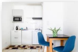
Studio for 3 persons