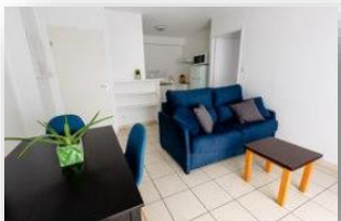
Apartment for 4 persons