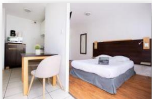
Studio for 2 persons

Free Wifi / Free parking / Laundromat / etc.