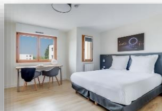
Superior Studio for 2 persons