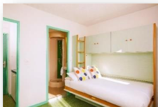
Studio for 1 person

Free WIFI / car park : free and paying / table tennis / Laundromat / 3 meeting rooms / etc.