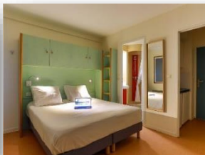
Studio for 2 persons