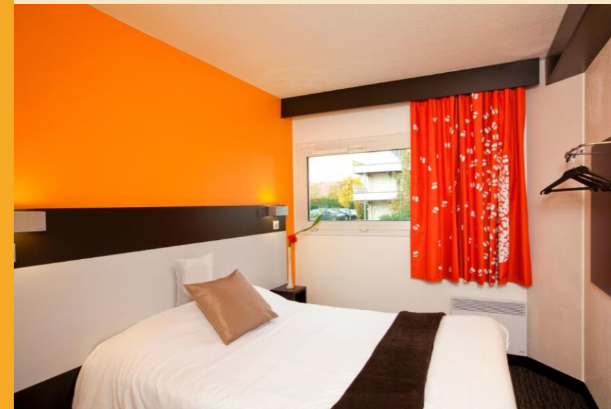
COMFORT ROOM DOUBLE BED OR TWIN BEDS

13m 2 Double bed - 140 x 190 cm & mezzanine bed 80 x 180cm