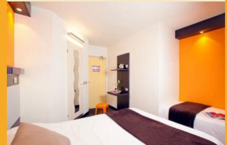
TRIPLE COMFORT ROOM

13m 2 Double bed - 140 x 190 cm & a bed 80 x 180cm