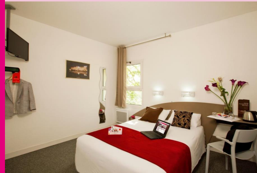
DOUBLE COMFORT ROOM