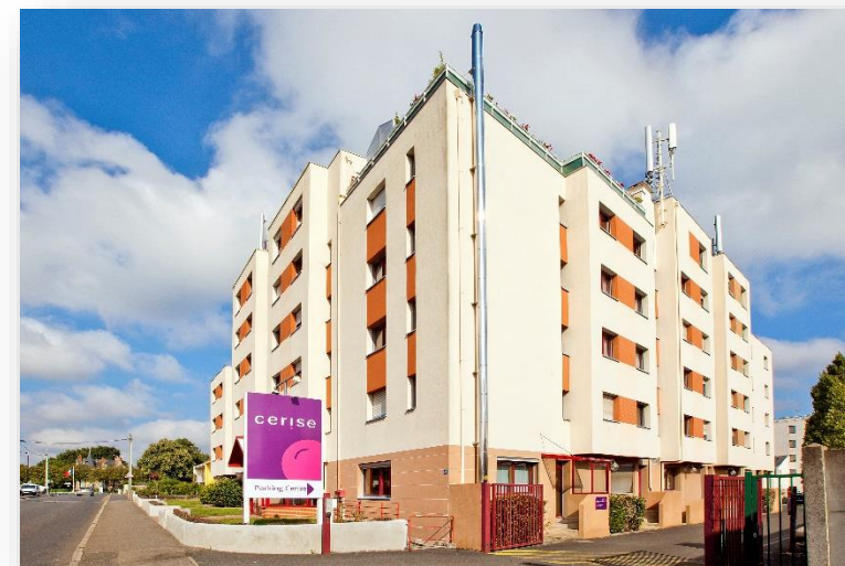
CERISE Nantes la Beaujoire