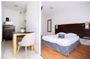
Studio for 2 persons

Free Wifi / Free parking / Laundromat / etc.