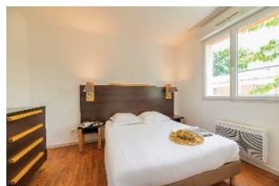
Apartment for 4 persons with terrace