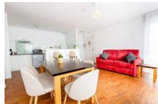
Apartment for 6 persons