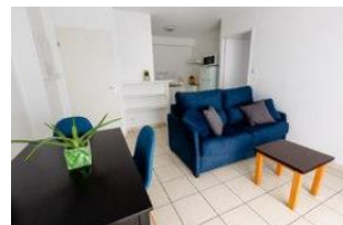
Apartment for 4 persons