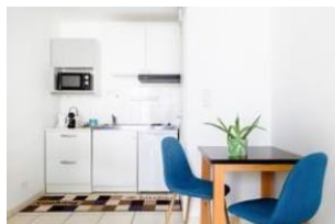
Studio for 3 persons