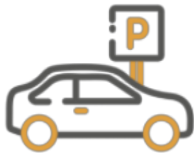
Free & secure parking