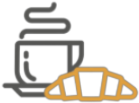
Buffet or Express Breakfast