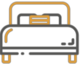
Bedding & towels included