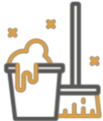
Cleaning included during and after the stay